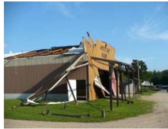
Damage to the Auction Barn at Kettle Moraine Ranch

from the downed trees. Horses had been trapped in a low area by