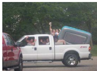
HONs load up for a trip to beach at Gov. Dodge Park